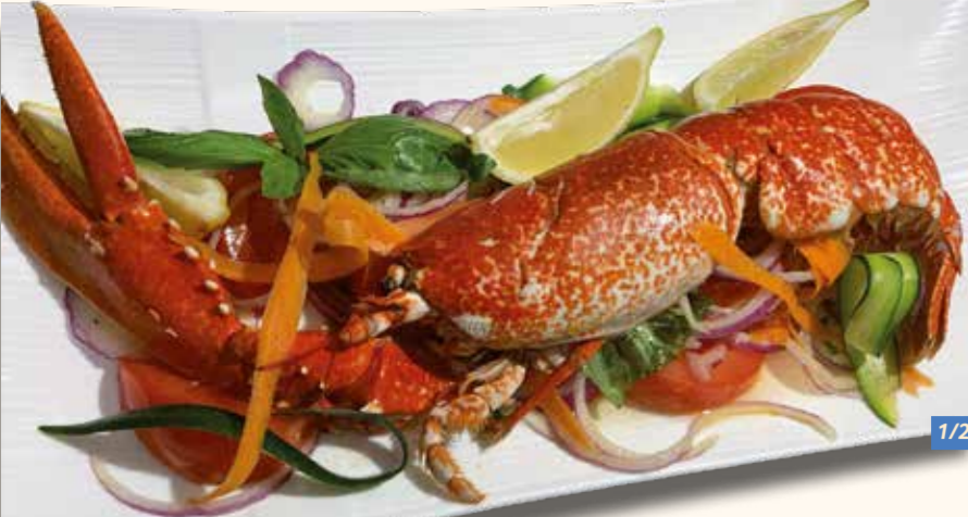
1/2 Homard à la Catalane