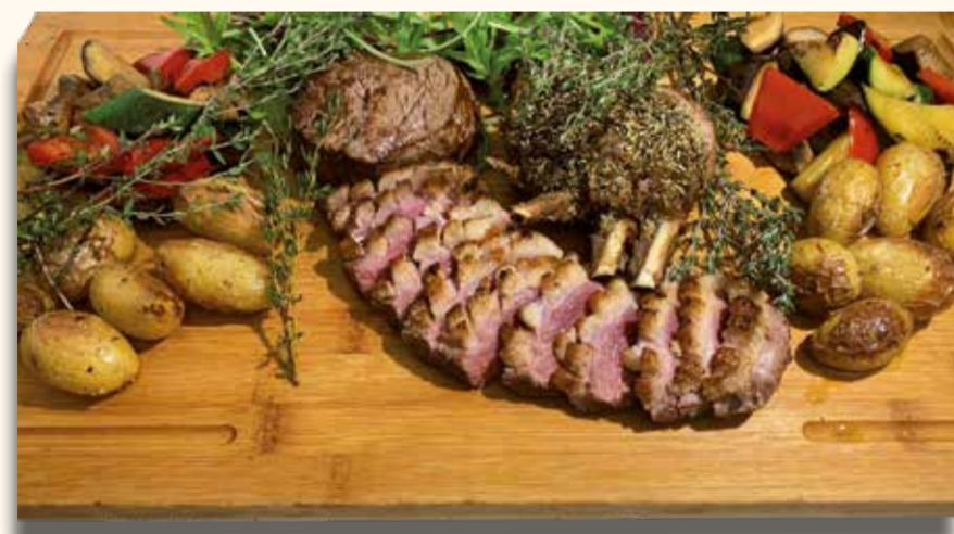
The Cannibal plate