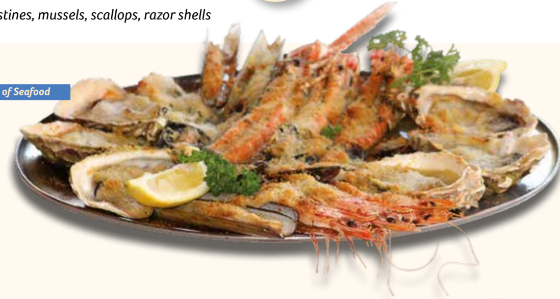
Gratin of Seafood