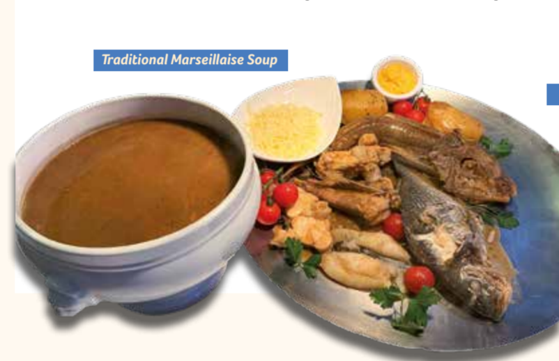
Traditional Marseillaise Soup

2 persons 78.00 € / 3 persons 110.00 € / 4 persons 140.00 €