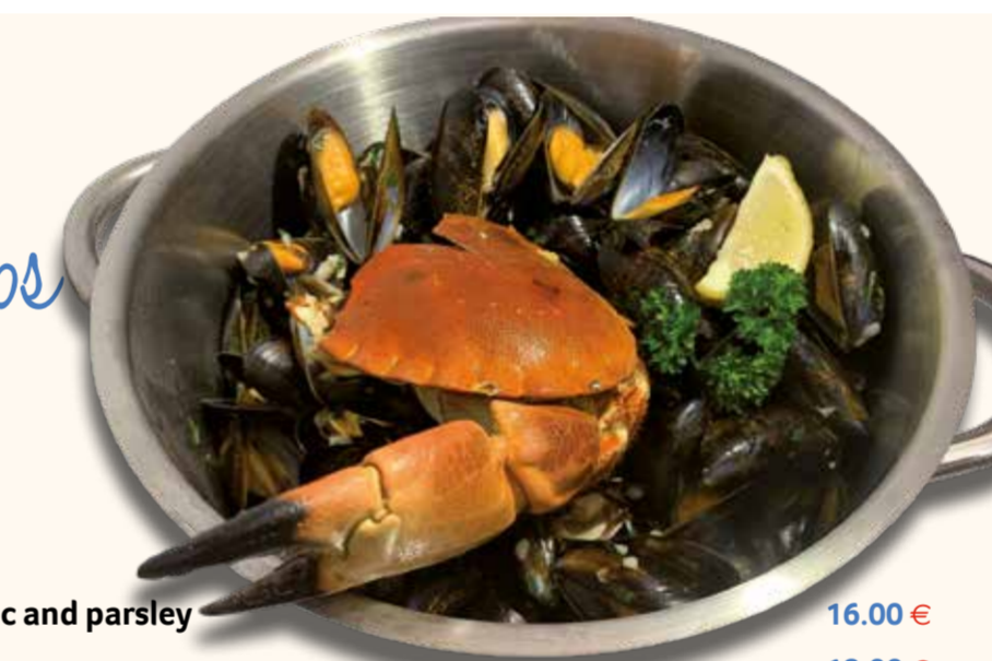
Mussels « marinière » and it's 1/2 crab

Casseroles of mussels and chips about 1 kg guaranteed fresh